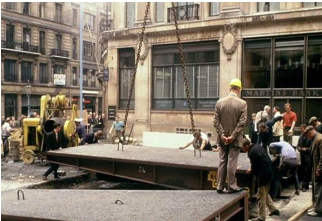
Images © Martins Bank Archive Collections: From "The Victoria Line Report No 2 - Down and Along" British Transport Films, August 1963 Images © BFI National Archive

ALTHOUGH WE HAVE several members who used to work at 'Oxford Circus' branch