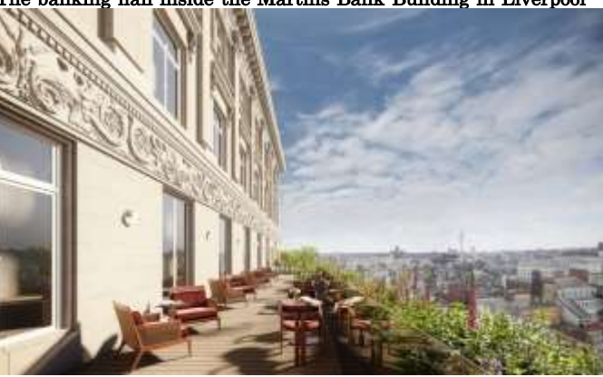
How part of the Martins Bank building will look after its

The banking hall inside the Martins Bank Building in Liverpool